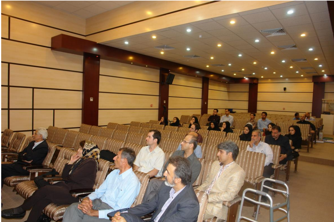
Professors, students and member of the Acarological Society of Iran.