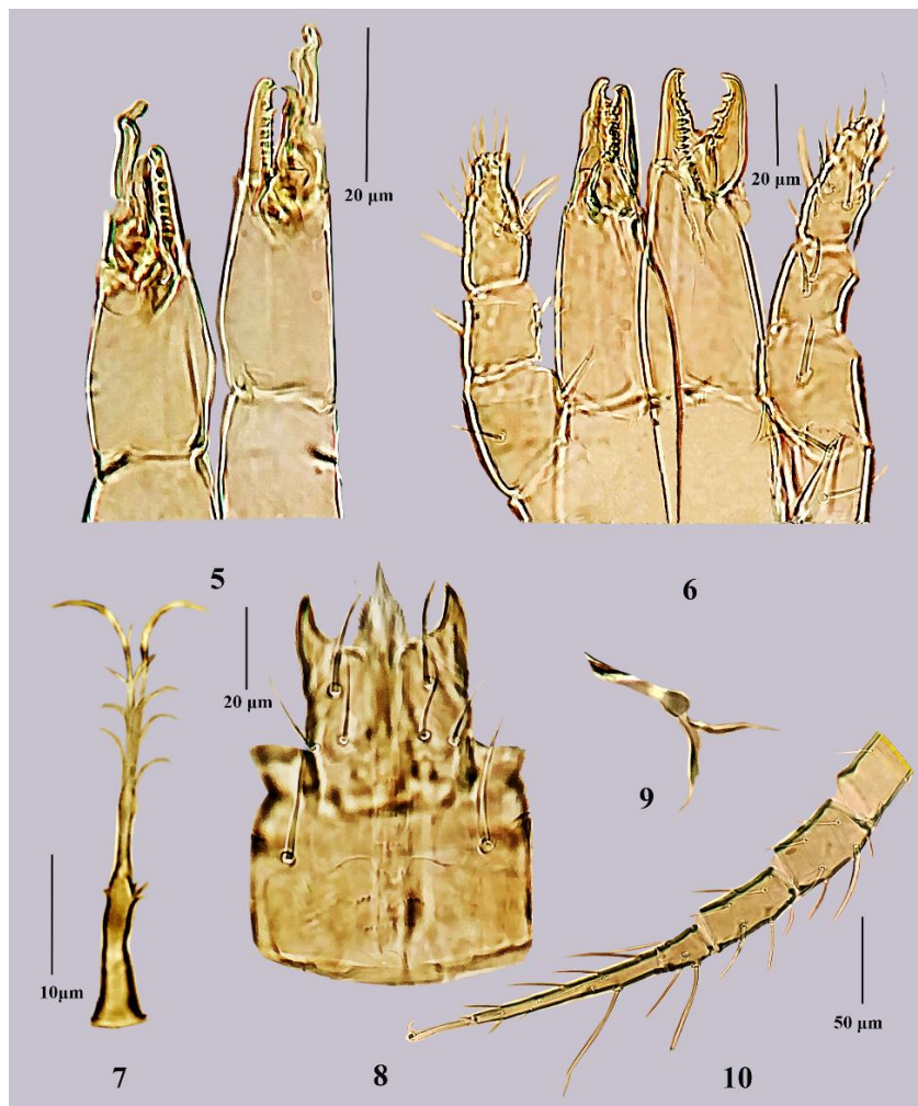
Figures 5–10. Lasioseius parberlesei – 5. Male, Chelicera. 6–10. Female. 6. Chelicera; 7. Tritosternum; 8. Hypostome; 9. Spermatheca (without scale); 10. Femur-tarsus of leg IV.