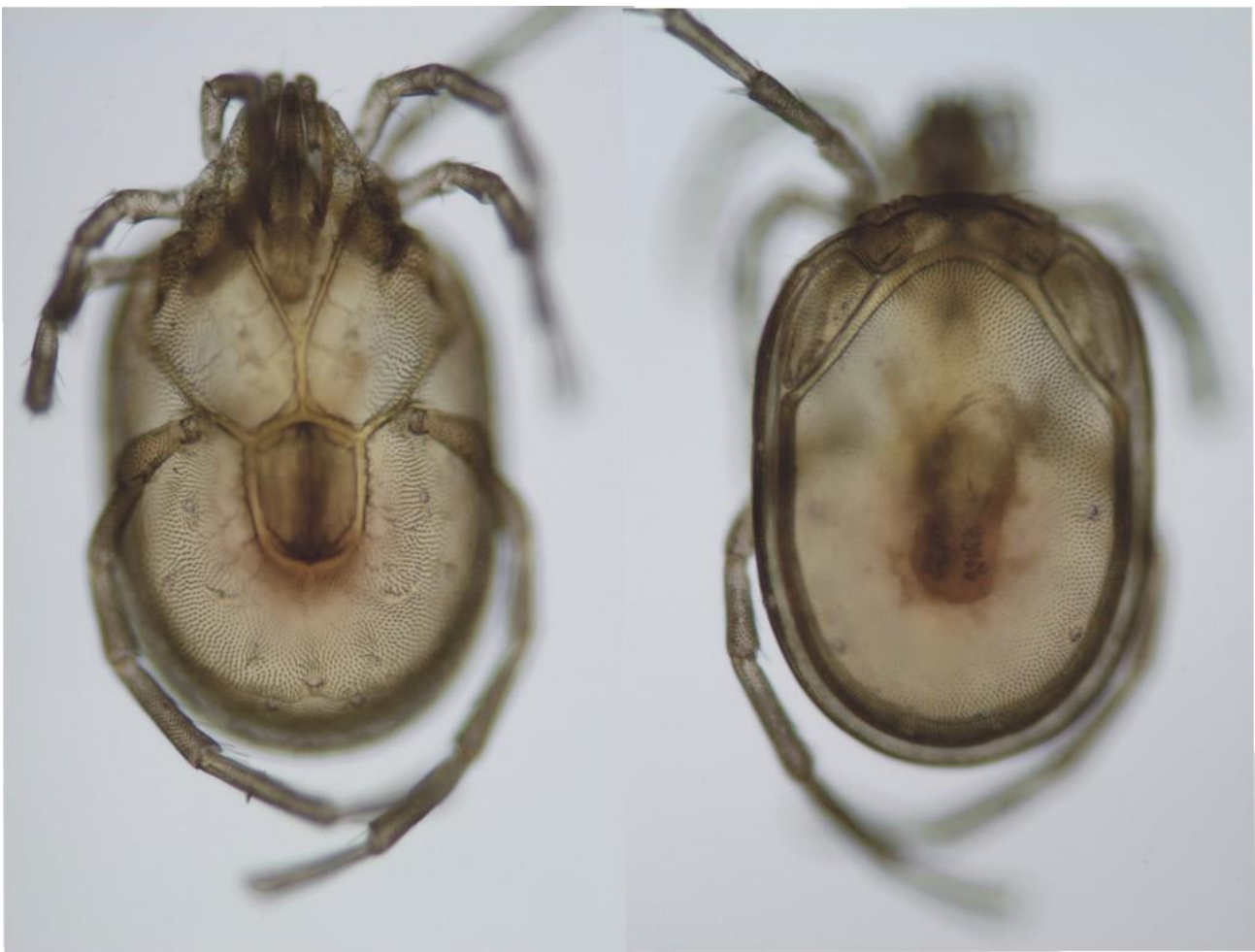
Figure 3. Male of Torrenticola cf. meridionalis (BGS1 B14a) from Babia Góra spring – Right. Dorsal habitus; Left. Ventral habitus.