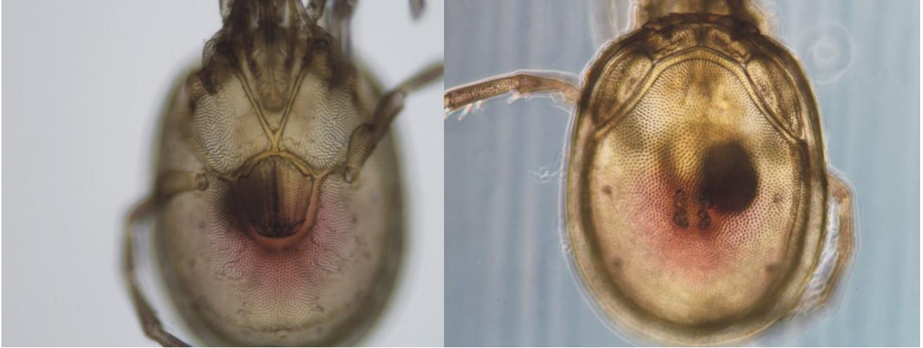
Figure 2. Female of Torrenticola cf. meridionalis (BGR1 B24a) from Babia Góra stream – Right. Dorsal habitus; Left. Ventral habitus.

in Poland (Figs. 2, 3), males collected in spring are different from T. meridionalis described by Di Sabatino and Cicolani (1990) mainly by location of excretory pore which was fused with the area of primary sclerotization in examined male specimen (Fig. 3).