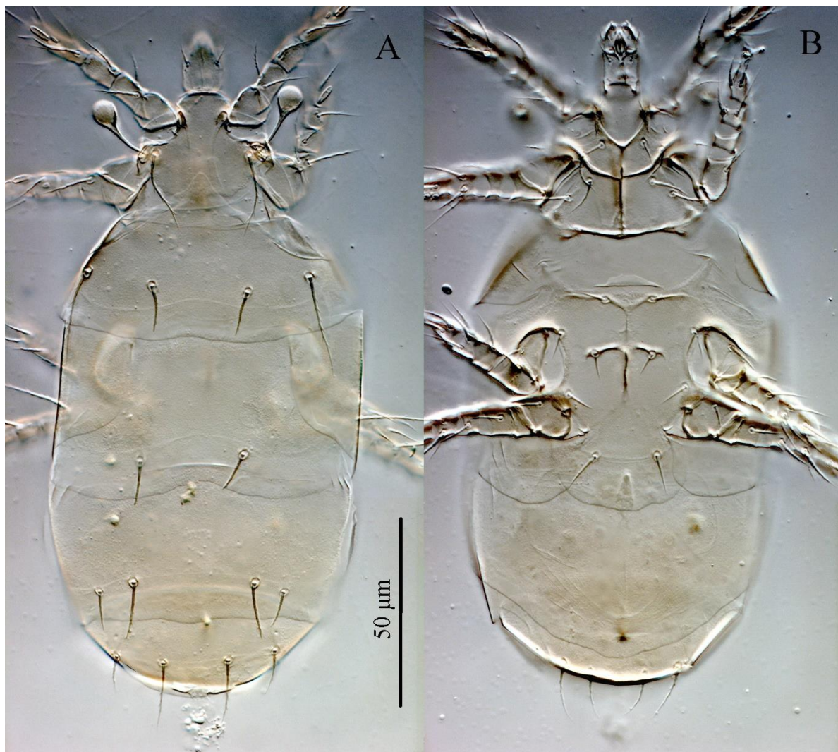
Figure 3. DIC micrographs of Premicrodispus (Premicrodispulus) kurganiensis sp. nov. (female) – A. Dorsum of body; B. Venter of body.