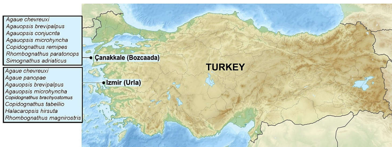
Figure 1. Map of the study locations, including the species reported in the study.

To date, there is no halacarid mite record from Aegean coast of Turkey. The halacarid mites studied were collected from Çanakkale (Bozcaada) (39.824039, 26.080924) (coll. B. Özalp; Feb. 10, 2020) and Izmir (Urla, Karantina Island) (38.374693, 26.784428) (coll. S. Yiğitkurt; Oct. 18, 2019) (Fig. 1).