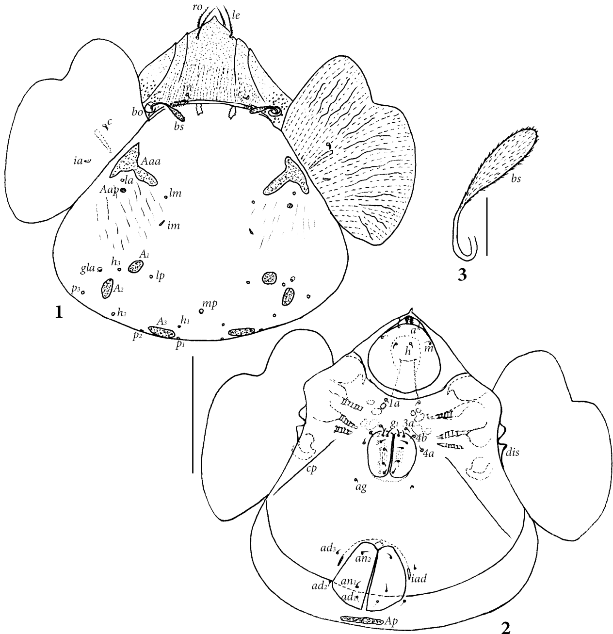
Figures 1–3. Pergalumna granulistriata Akrami sp. nov. – 1. Dorsal view of body; 2. Ventral view of body; 3. Bothridial seta. Scale bar (1 & 3 = 50 \mu m; 2 = 25 \mu m).

Prodorsum (Figs. 1, 3, 4) – Rostrum with pronounced triangular central tooth and two smaller lateral teeth. Basal half of prodorsum with longitudinal striae and the rest microgranulate. Lamellar ( L ) and sublamellar ( S ) lines well developed. Rostral setae ( ro , 53–57) thin, finely barbed unilaterally, inserted ventrally and well visible in dorsofrontal view. Lamellar setae ( le , 51–55) thin, finely barbed unilaterally. Interlamellar setae ( in , 13) minute, very thin and smooth. Exobothridial setae not observed. Bothridial setae ( bs ) with thin, smooth stalk (33–37) and finely barbed claviform head (34), distally rounded, directed inwards. Dorsosejugal porose areas ( Ad , 22–27 × 7) elongate oval, located lateroposterior to alveolus of setae in . Bothridia ( bo , 19 × 14) funnel-like, with wide openings, directed laterally.