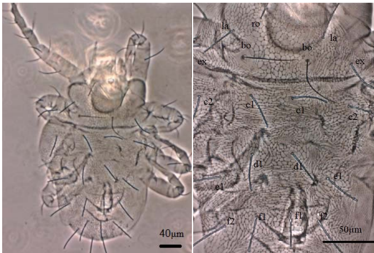
Figure 3. Habitus of Lorryia reticulata , dorsal view (left), and dorsal idiosomal reticulations (right).