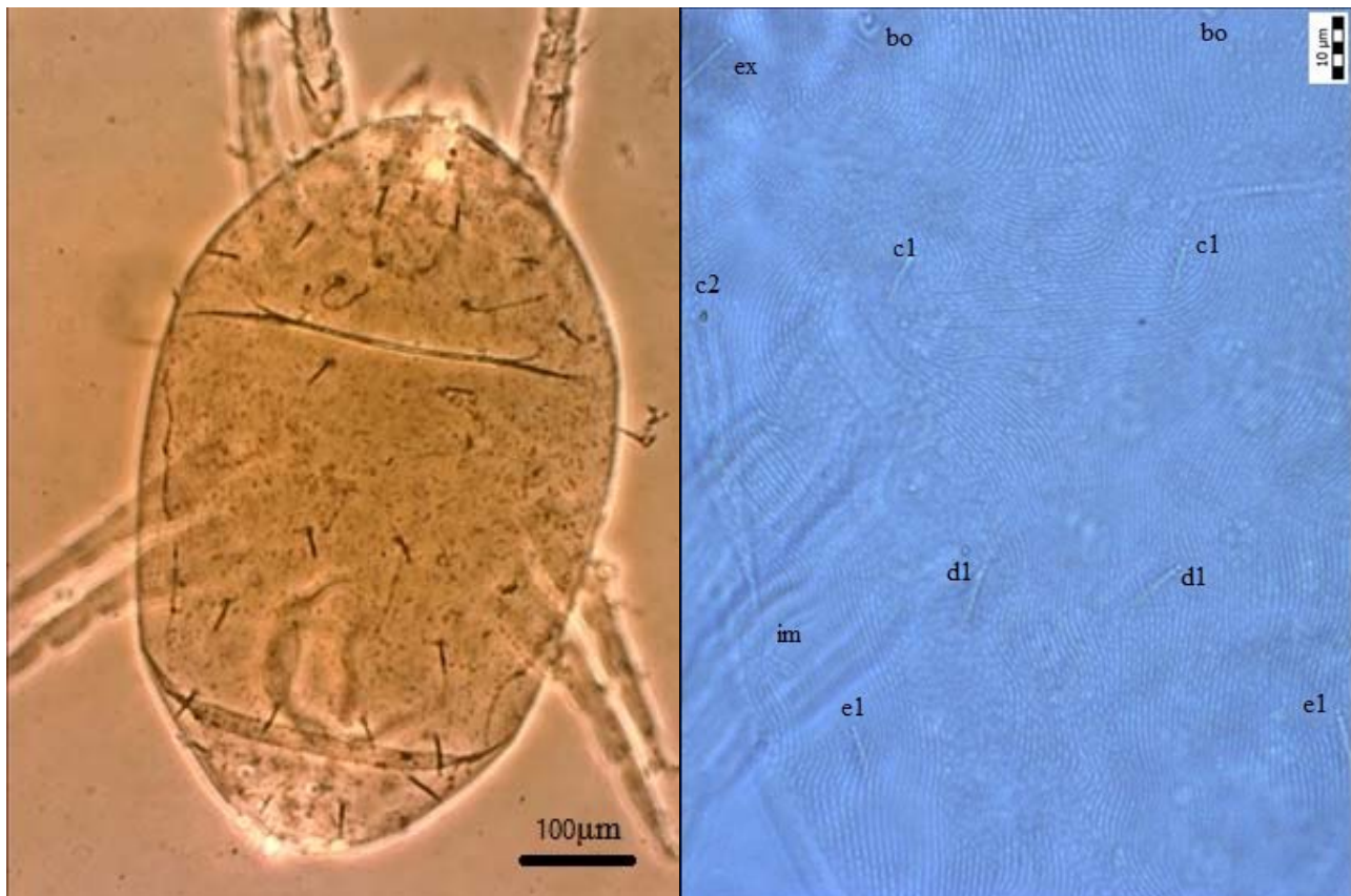
Figure 2. Habitus of Lorryia maga female, dorsal view (left) and dorsal idiosomal setae and striations (right).

Examined material – Chamestan, Angaetaroud village, Noor city, 36° 25' 24" N, 52° 13' 14" E, H: 191 m a.s.l., moss, 1 August 2013, 2♀.