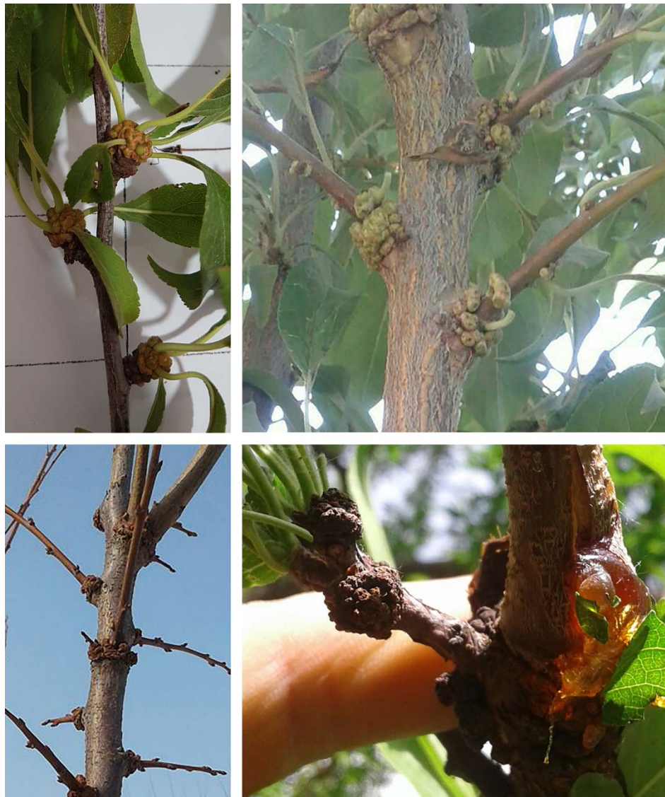
Figure 1. Stem galls caused by Acalitus phloeocoptes (Nalepa).

Aceria dioicae (Keifer) – collected from Tamarix sp. (Tamaricaceae) in two localities (Table 2).