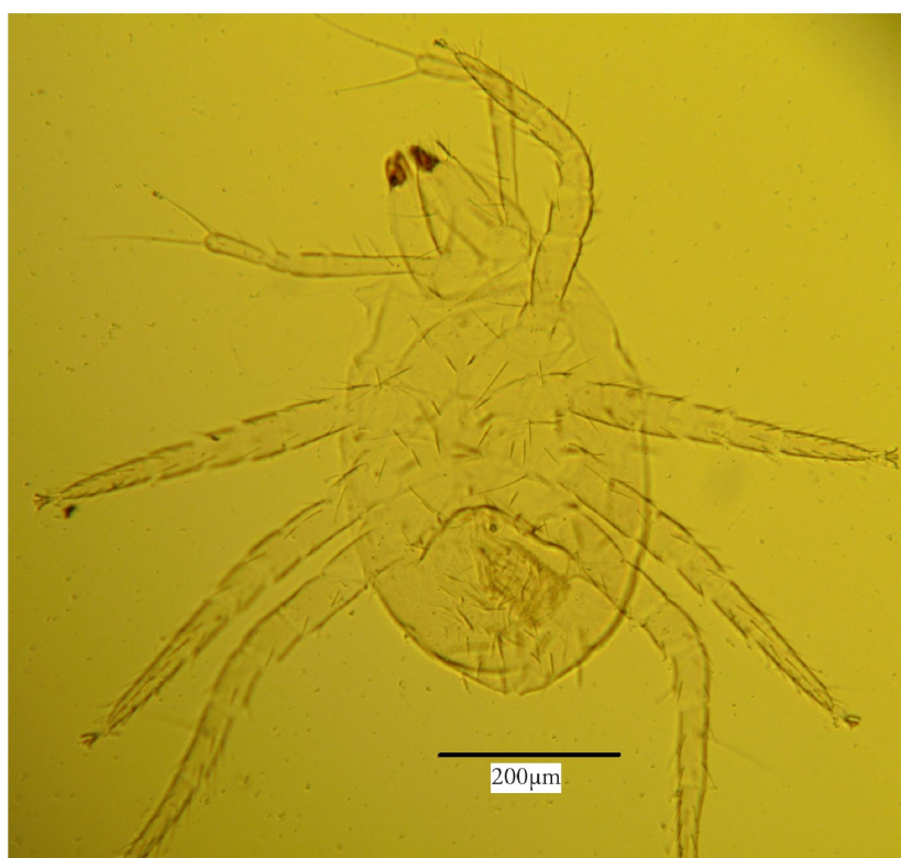
Figure 1. Cyta kreiteri Barbar & Ueckermann, 2017 (Female) – Dorsal view of idiosoma.

Material examined – Two females from soil and rotten leaves under walnut tree, Sarmargh village, 15 February 2019, Khorramabad city, Lorestan Province, Iran.