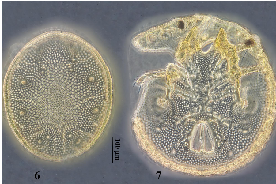
Figures 6–7. Photographs of Africasia iranica sp. nov. (female) – 6. Dorsal plate; 7. Ventral plate.