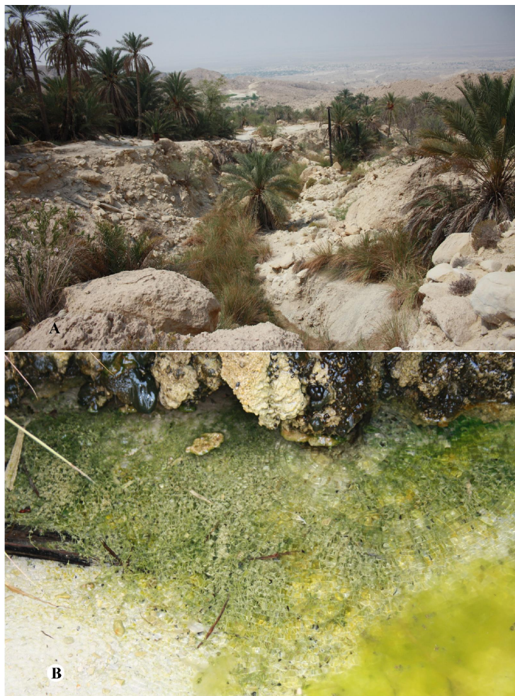
Figure 8. Photographs of sampling sites of Africasia iranica sp. nov. (A, B).