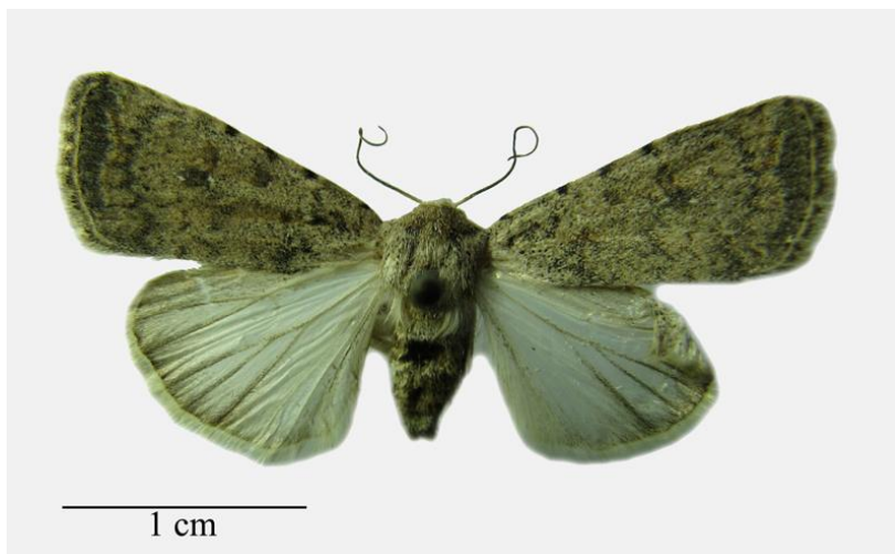
Figure 2. Caradrina clavipalpis (Scopoli) (Lepidoptera: Noctuidae) the host of Nothrotrombidium sp. larva.

Nothrotrombidium birjandensis Noei, 2017 was collected from the original location, South Khorasan province, Birjand.