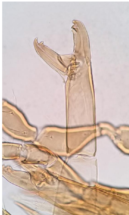
Figure 2. Olopachys hallidayi (female) – Chelicera.

Lengths of dorsal and ventral setae: j1 23–42, j2 92–112, j3 104–115, j4 83–97, j5 68–85, j6 82–95, J1 88–105, J2 83–110, J3 100–113, J4 102–125, J5 6–10, z1 unavailable, z2 106–125, z4 104–115, z5 68–80, z6 96–117, Z1 104–125, Z2 102–115, Z3 102–114, s2 86–113, s4 102–126, s5 98–120, s6 68–85, S1 68–92, S3 68–83, S4 88–115, S5 98–125, r2 98–123, r3 88–108, r5 74–90, r6 35–47. Distances between some pairs of dorsal and ventral idiosomal setae: j1–j1 12–15, j2–j2 50–63, j3–j3 75–90, j4–j4 128–163, j5–j5 105–130, j6–j6 93–125, J1–J1 95–115, J2–J2 155–169, J3–J3 94–113, J4–J4 127–175, J5–J5 30–50, z1–z1 45–55, z2–z2 198–243, z4–z4 263–300, z5–z5 138–165, z6–z6 225–260, Z1–Z1 355–440, Z2–Z2 357–443, Z3–Z3 270–333, s2–s2 250–290, s4–s4 353–420, s5–s5 363–453, s6–s6 458–565, st1–st1 68–83, st2–st2 140–158, st3–st3 125–150, st4–st4 135–160, st5–st5 148–203, JV1–JV1 238–277, JV2–JV2 127–183.