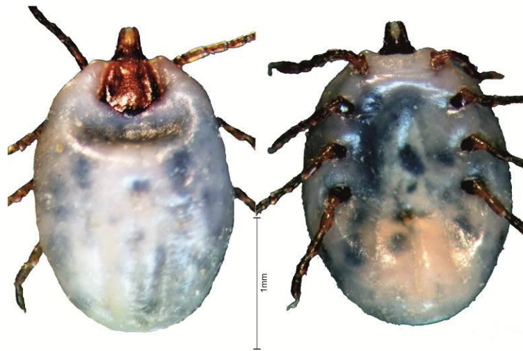
Figure 3. Immatures of Hyalomma asiaticum collected from Meriones persicus in western Iran (nymphal stage): left: dorsal and right: ventral views.

LUMS: Lorestan University of Medical Sciences