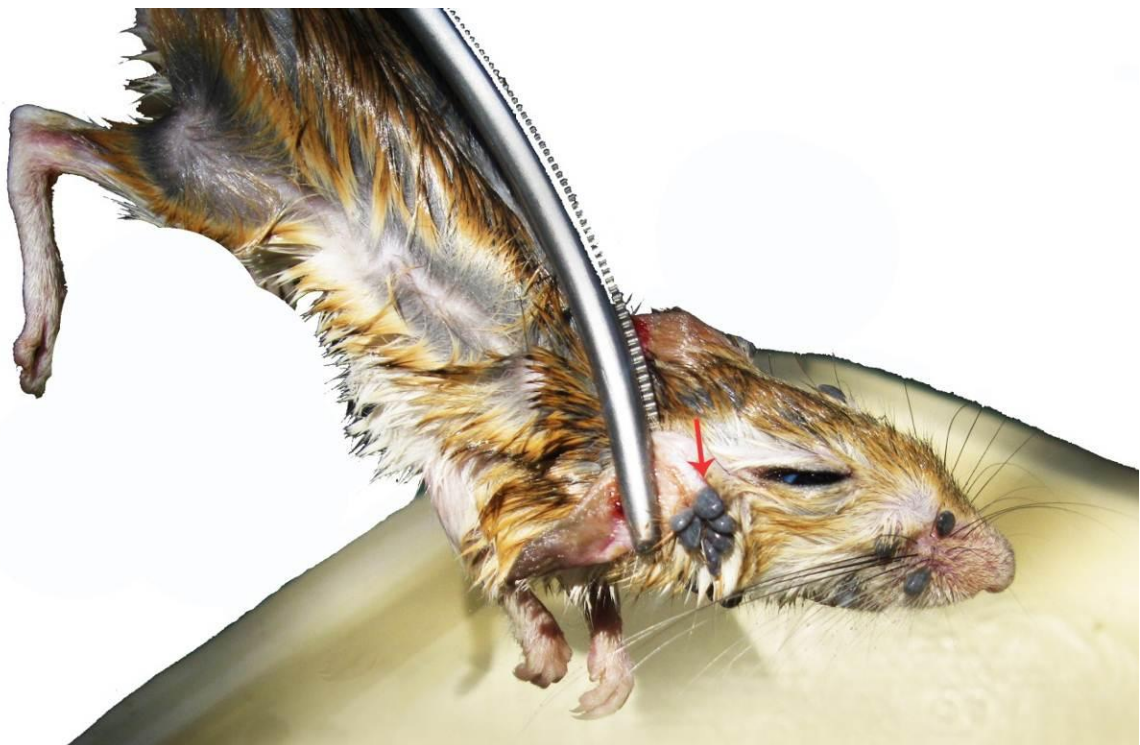
Figure 2. A rodent specimen infested by a number of immature ticks (red arrow) (animal is restrained through the ear by forceps and treated by insecticide for killing of ectoparasites).