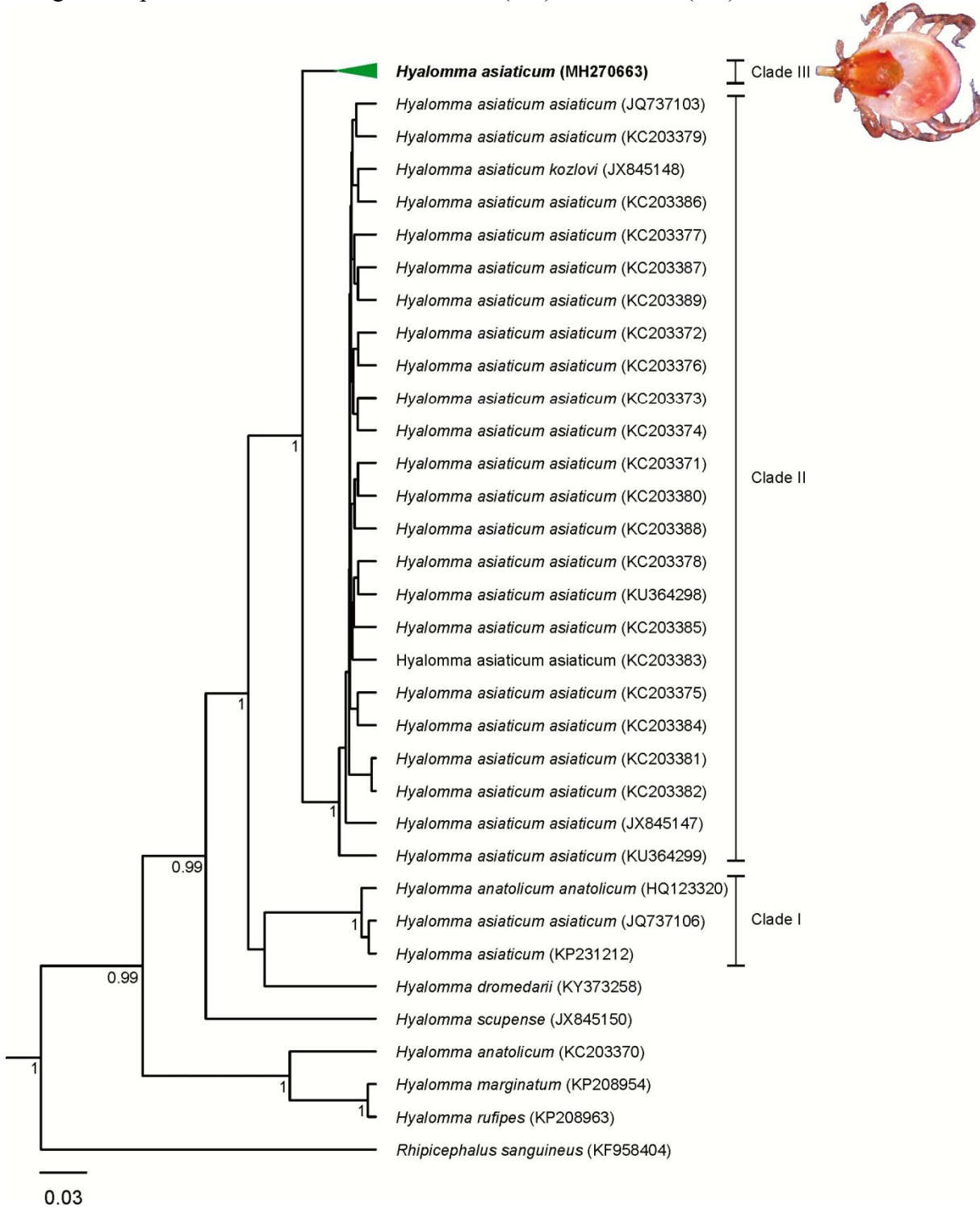
Figure 5. Phylogenetic tree of Hyalomma asiaticum ticks inferred from ITS2 sequence data constructed using Bayesian Inference (BI) method. Nodes indicated with posterior probability values. Branch lengths are proportional to evolutionary changes (substitutions/site). Tree was rooted by Rhipicephalus sanguineus .

China (JQ737103, JX845147-8, KC203371-89 and KU364298-9). Clade I consisting of sequences labeled as H. asiaticum (JQ737106, KP231212) from China and Iran and one sequence of H. anatolicum (HQ123320) from Iran appeared as a sister clade of H. dromedarii . The genetic distances between the three clades of H. asiaticum are shown in Table 2. in which, remarkable divergence separated Clade III from the clade II (7%) and Clade I (4%).