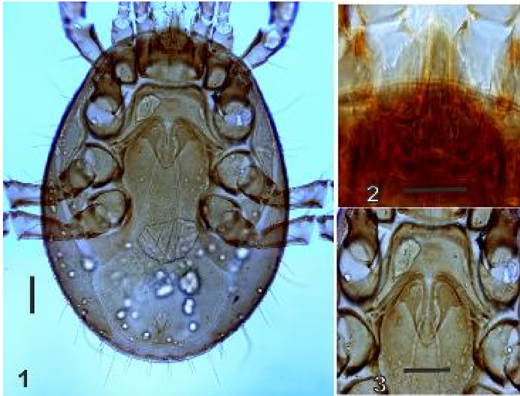
Figures 1–3. Euroschizogynium calvum Trach & Seeman, 2014 – 1. Ventral view of idiosoma; 2. Epistome; 3. Sternal and latigynial shields (scale bars = 100 \mu m).