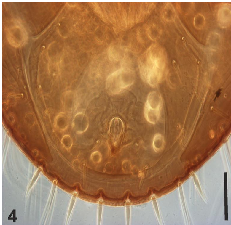
Figure 4. Euroschizogynium calvum Trach & Seeman, 2014 – Large pre-anal membranous region (scale bar = 100 \mu m).