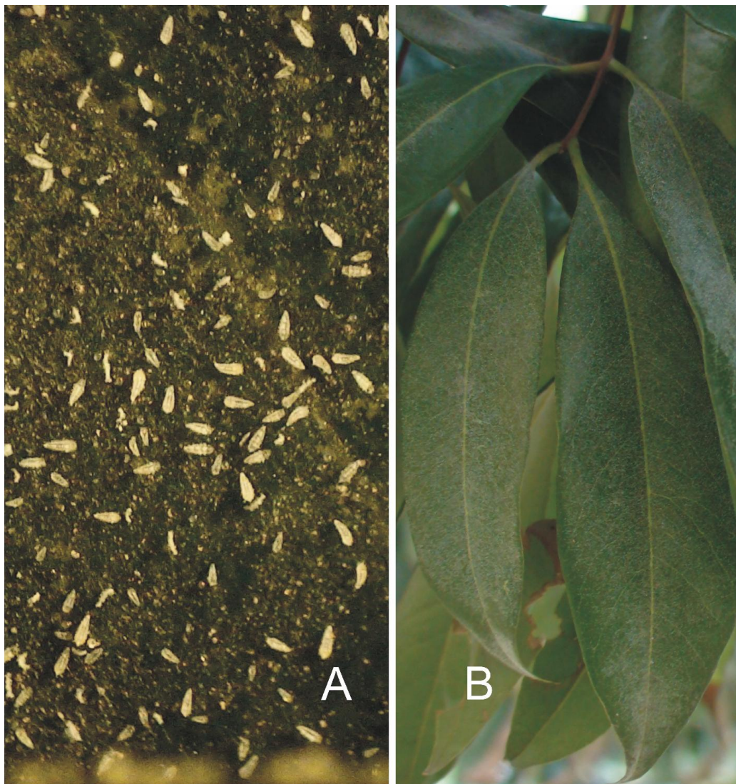
Figure 1. Notacaphylla chinensiae Mohanasundaram and Singh – A. Live mites of different stages and their exuvia; B. symptoms of infestation on litchi leaves.

alterations caused by the mite might have a negative influence on the photosynthetic activity of litchi plant which needs to be ascertained such as the impact on the yield.