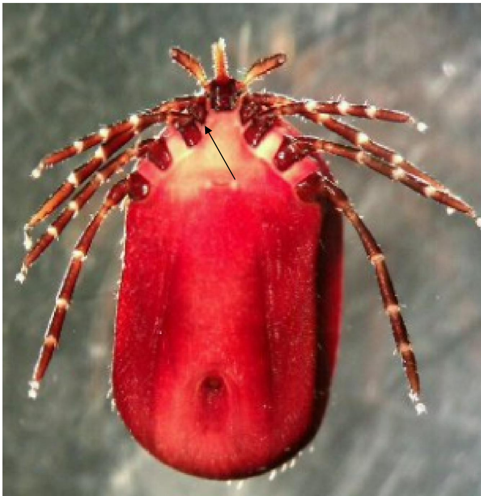
Figure 1. Ixodes hexagonus - Ventral view of body, coxa I with internal spur.

Ticks have a major role in disease transmission, anemia, dermatosis, paralysis, and otoacariasis. Diseases such as Crimen–Congo haemorrhagic fever, Q fever, Boutonneuse fever, and Rocky Mountain spotted fever are examples that show their impact on medicine and veterinary. Thus, the study of these ticks has become a matter of the highest importance in connection with the prevention of the diseases. Tick-borne diseases are of increasing public health concern because of range expansions of both vectors and pathogens (Margos et al. 2011). Lyme borreliosis is the most common arthropod-borne human disease in temperate regions of the northern hemisphere. The causative agents of Lyme borreliosis (and other tick-borne borrelioses) are spirochaetes belonging to the B. burgdorferi sensu lato species complex. It is well known that B. burgdorferi are unique among the pathogenic spirochaetes by requiring obligate blood-feeding arthropods for their transmission and maintenance in vertebrate host populations.