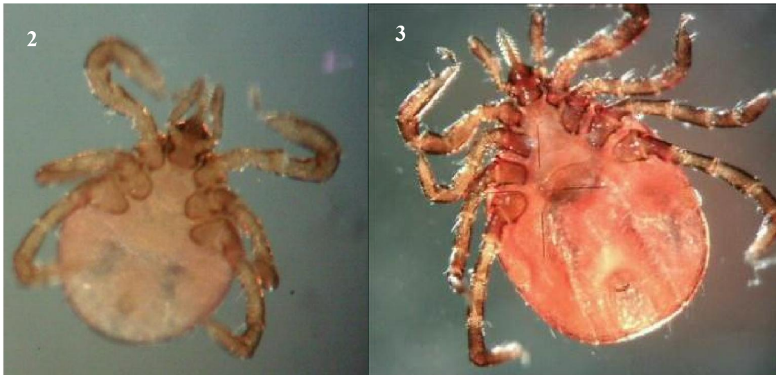
Figures 2–3. Ixodes hexagonus - 2. Larva; 3. Nymph.

All known causative agents of borrelioses circulate between ticks and wide variety of vertebrates' species (mammals, birds and reptiles). Consequently, Borrelia populations are shaped by the dynamics and demographic processes of host and vector populations, host and vector immune responses and extrinsic a biotic factors (e.g. combination of temperature, humidity and types of climate and landscape) affecting host and vector populations (Margos et al. 2011).