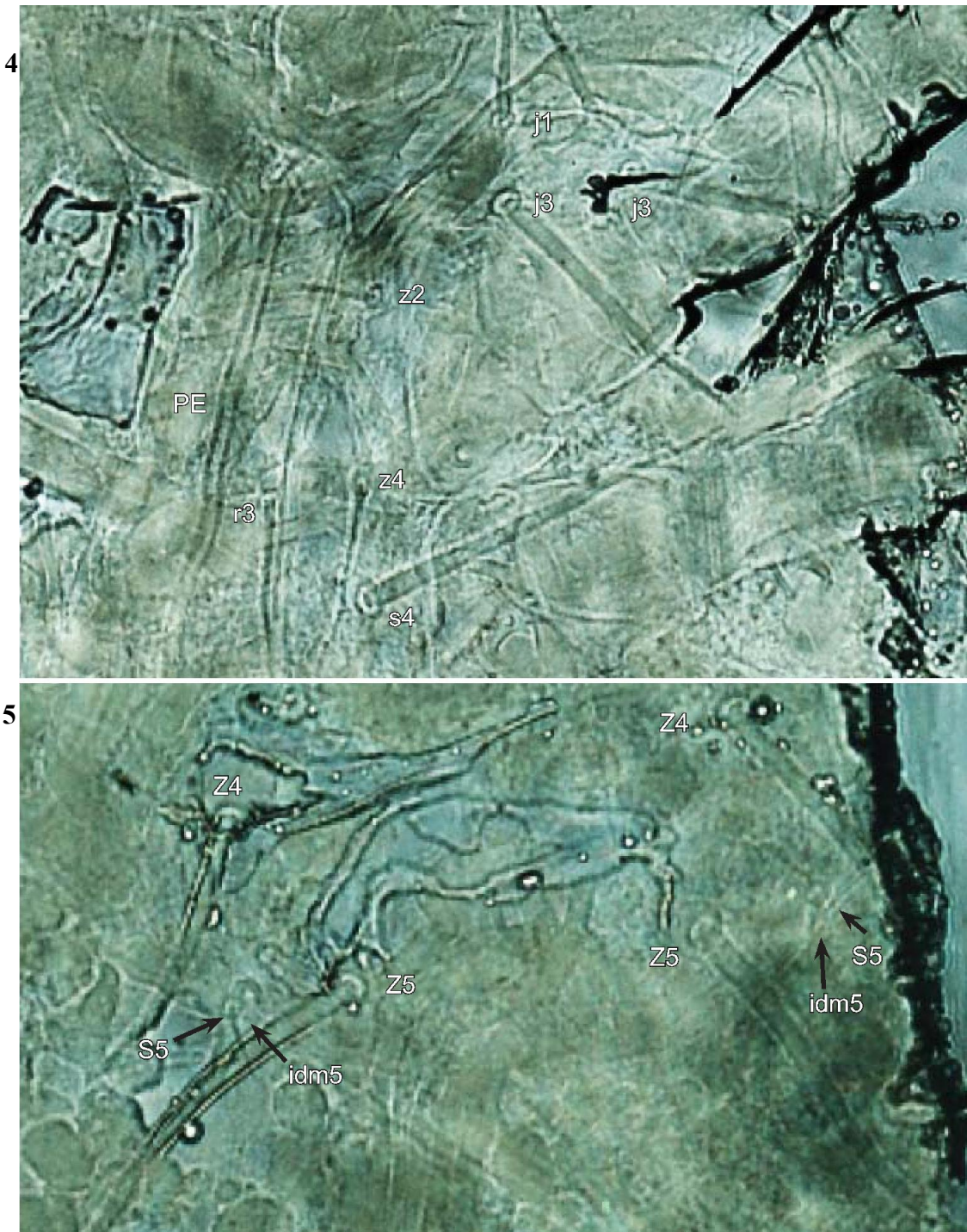
Figures 4–5. Paraphytoseius scleroticus (Gupta & Ray) - 4. (Top), Holotype female in high magnification showing anterior idiosoma with peritreme (PE) on left, seta r3 on right to it, and lightly sclerotized dorsal shield with landmark setae j1, j3, z2, z4, and s4 (seta r3 on integument); 5. (Bottom), Same female showing posterior dorsal shield with setae Z4, Z5, S5 and barely visible lyrifissure idm5 posteromedial to S5.

Figure 3 is an enhanced photograph which shows the entire idiosoma of the female with seta r3 on the integument beside the dorsal shield near the peritreme. The dorsal