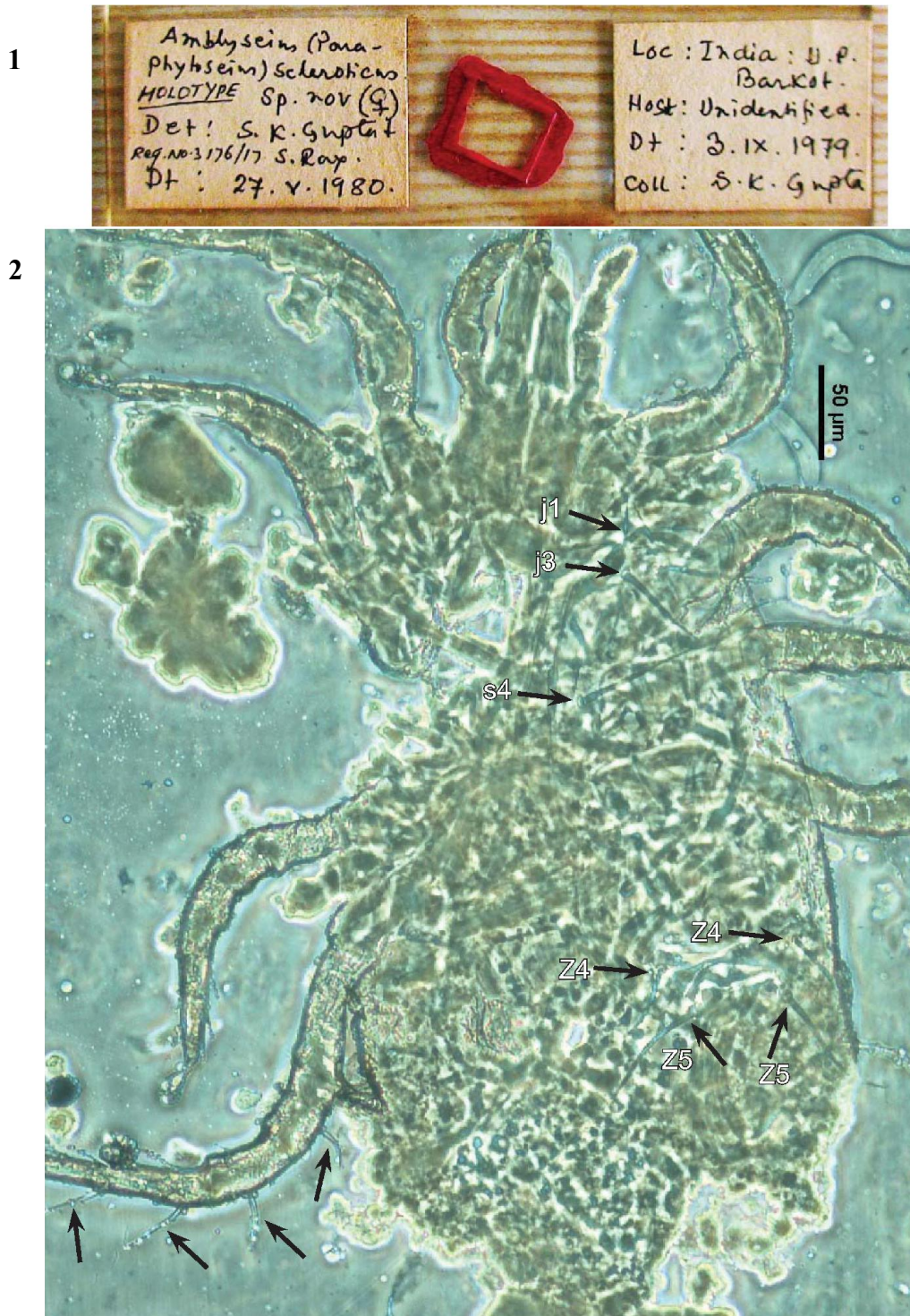
Figures 1–2. Paraphytoseius scleroticus (Gupta & Ray) - 1. (Top), Slide with holotype female; 2. (Bottom), Holotype female in low magnification - Large setae j1, j3, Z4, Z5, s4, and macrosetae on leg IV (pointed by arrows).

Voucher photos of holotype female - In spite of being 33 years old and distorted in dried and shrunken Hoyer's medium, the female shows major characteristics very well, even in the photo (Fig. 2) shows the female chelicerae and palps of the gnathosoma at low magnification. The idiosoma has 4 pairs of legs and the landmark setae j1, j3, Z4,