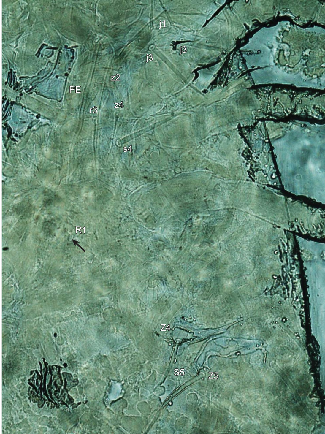
Figure 3. Paraphytoseius scleroticus (Gupta & Ray) - Holotype female in high magnification showing idiosoma with peritreme (PE) on left, seta r3 on right to PE, and lightly sclerotized dorsal shield with landmark setae j1, j3, z2, z4, Z4, Z5, s4, and S5. Seta R1 on integument barely seen.

Z5, and s4 are clearly seen as labeled. Dorsal shield is not evident clearly which is usually very soft or poorly sclerotized in Paraphytoseius species. Leg IV also shows primary macroseta on genu, tibia, basitarsus, and distitarsus. Setae z2, z4, S5, and r3 are not evident at this low magnification.