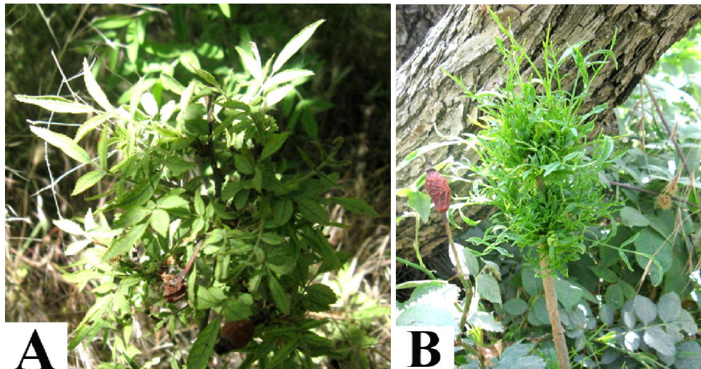
Figure 2. Damage of Acerimina bajgahi sp. nov. on hybrid of a Rosa species - A) Mild damage; B) Sever damage.

The specific epithet is derived from the type locality, Bajgah, Shiraz, Iran.